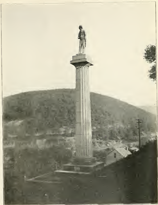
HENRY CLAY MONUMENT, POTTSVILLE Cornerstone Laid July 28, 1852, Dedicated July 4, 1855

Henry Clay. Born in Hanover county, near Richmond, Va., April 12, 1777; died at Washington, D. C., June 29, 1852. A celebrated American statesman and orator. He was United States senator from Kentucky, 1806-07 and 1810-11; was member of Congress from Kentucky, 1811-21 and 1823-25 (serving as speaker 1811-14, 1815-20 and 1823-25); was peace commissioner at Ghent in 1814; was candidate for the presidency in 1824; was secretary of state, 1825-29; was United States senator, 1831-42 and 1849-52; was Whig candidate for presidency in 1832 and 1844; was the chief designer of the "Missouri Compromise" of 1820, and of the compromise of 1850; and was the author of the compromise tariff of 1833.